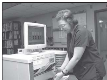
The R2 Reader is a Computer Aided Detection (CAD) system that assists radiologists in breast cancer screening. It pinpoints and marks on the patient’s mammogram locations that radiologists then re-examine.

TEAM Foundation continues the generous support of MeritCare started by TEAM Industries. They have made a substantial donation to the renovation of the Children’s Hospital, specifically the Pediatric Intensive Care Unit. They were a major contributor in the purchase of the R2 Reader.