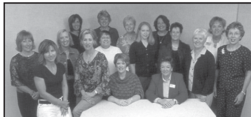
2004 Festival of Wreaths Steering Committee

Sunday's new feature will be a Sunday Brunch and Style Show. "We'll show what's trendy, but at the same time we'll make sure it's 'real-people' clothes," says Sally.