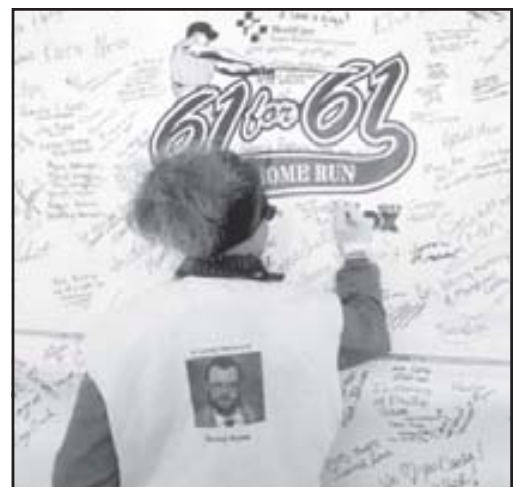
A Home Run/Walk participant writes a tribute on the Honor/Memorial wall.

In all areas, the patient is the primary concern with the hope of bringing new treatments and knowledge into the fight against cancer, as well as lessening the impact that the cancer diagnosis has on the quality of life for both the patient and their family.